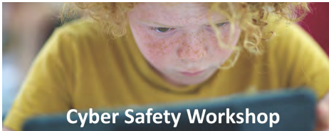
Cyber Safety Workshop