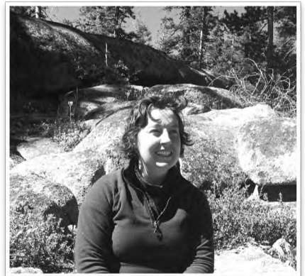
Some days my work involves wading through a pristine river, camping in the mountains or spending a day in a vineyard in the Napa Valley as we start to measure what's going on with water in those places. Those days are definitely exciting (especially when there's a bear or mountain lion in the area).

When we got to start learning science - we started by learning about electricity. I felt so grown up learning how the electric circuit we had worked to turn a light globe on and off. We were so excited to start learning that stuff.