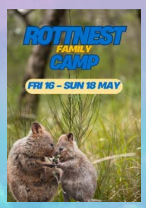
ROTTNEST FAMILY CAMP Friday 16 - Sunday 18 May FIND FERRY DISCOUNT CODES HERE