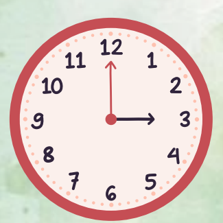
3pm Pre-Kindy & Kindy