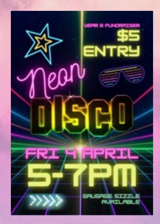
TERM 1 DISCO Friday 4 April