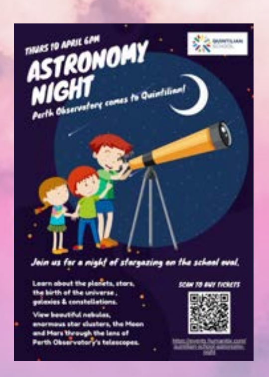
ASTRONOMY NIGHT Thursday 10 April BUY TICKETS HERE